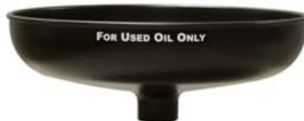
831886 - Replacement Drain Bowl