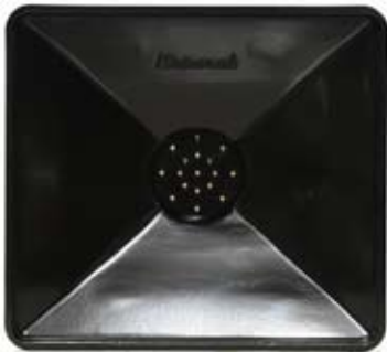
4140-006 - Transmission Drain Pan.