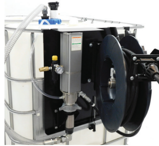
*control handle not included