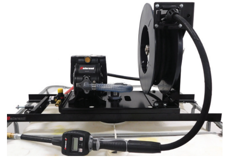
*control handle not included