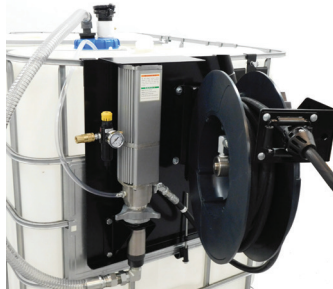
*control handle not included