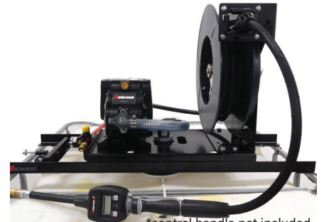
*control handle not included