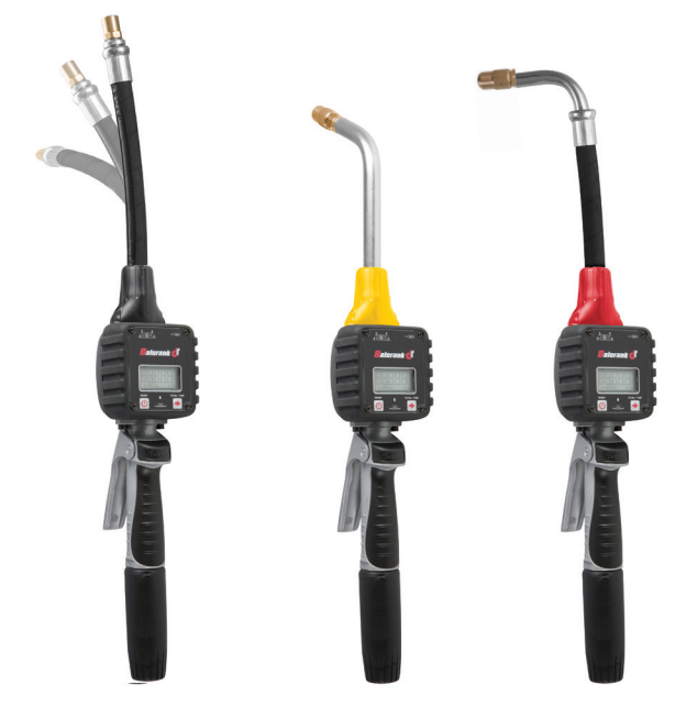
See Dispense nozzle OD for important details