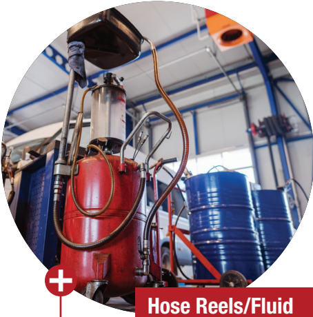
Hose Reels/Fluid Dispense Handles

Here are just a few sample scenarios where you can save in the long term with additional equipment today: