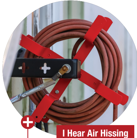
I Hear Air Hissing In My Shop

Hose reels over time can leak air and/or fluid depending on the reel type and service used. These leaks can occur over time, causing your compressor to run more than needed and/or creating a possible slipping hazard. Either of these conditions indicate a potential issue and, in many cases, a simple inexpensive repair can prevent potential larger costs. Same for a fluid dispense handle, drips can indicate potential issues that can be easily prevented. It may be as simple as changing out the nozzle assembly. Thankfully, your Mighty rep has Balcrank ¼-turn nozzle assembly that can resolve the issue.