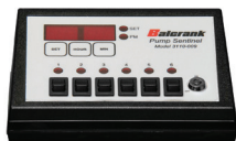
Pump Sentinel Console End of day safety air shut-off for up to 6 pumps