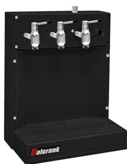
Oil Bar Dispenser