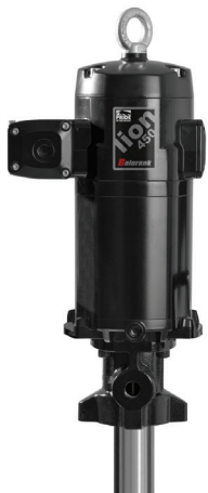
Lion™ 450 3:1 Pump