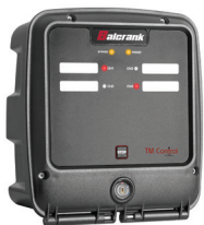
TM Control 4 tank standalone monitor