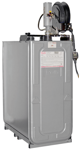
Lightweight Double Wall Tank