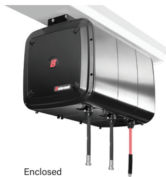
Enclosed Hose Reel