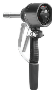
MR (Mechanical Registry) Meter