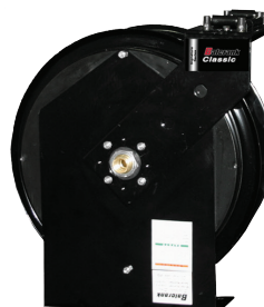
Classic Hose Reel