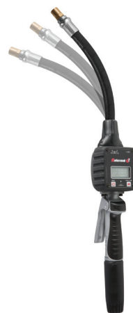
DR (Digital Register) Meter